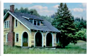
The Fifield Farmhouse circa 1963, prior of the sale to our Sons of Norway Lodge.