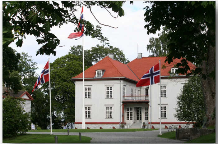
Eidsvoll Manor—Eidsvoll, Norway